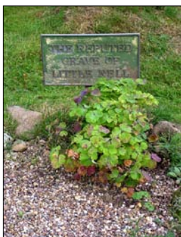
This memorial to Charles Dickens' Little Nell can be seen in Tong churchyard