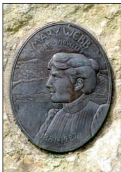
The Mary Webb memorial plaque can be seen in Church Walk, Much Wenlock

Another famous author was A E Housman. Although not native to Shropshire – he was born in Fockbury in neighbouring Worcestershire – he appears to have fallen in love with the county from a distance, his “blue remembered hills” almost certainly being the view from near his home. Although he failed to graduate from Oxford, he later became a respected academic and in 1892 was appointed Professor of Latin at University College London. The romanticism of his first collection of poems, A Shropshire Lad , was in complete contrast to his previous writings which had mainly been scholarly articles on the classics. What is also interesting is that some of the poems were written before Housman ever visited Shropshire, which may account for such anomalies as his steeple on Hughley church.