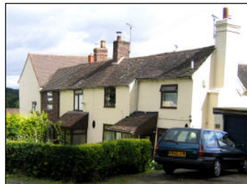
The Rock is on the north side of the Ironbridge Road