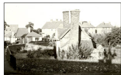
The site was redeveloped in the early 1970s