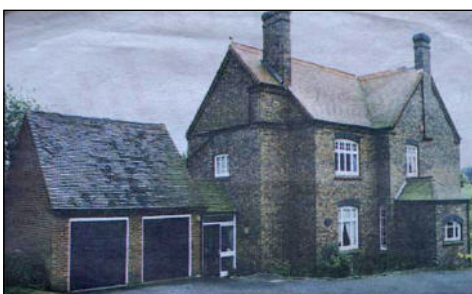
The Downs in Dark Lane became the family home