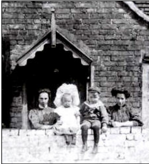
Top: The Dog and Duck Inn at the Jackfield ferry which was demolished in 1939