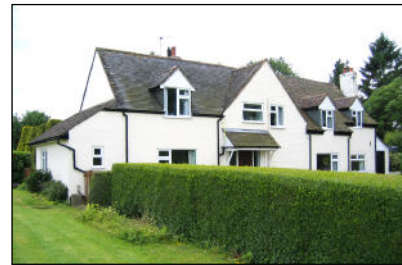
The Folly, now one house, is down a track off the Coalport road

The Broseley Tithe lists three Langfords at the Folly. The house at the Folly was next to a small mine so it may not have been a nice place, however it does look out over fields. I do not have any details of Langfords at the Rock.