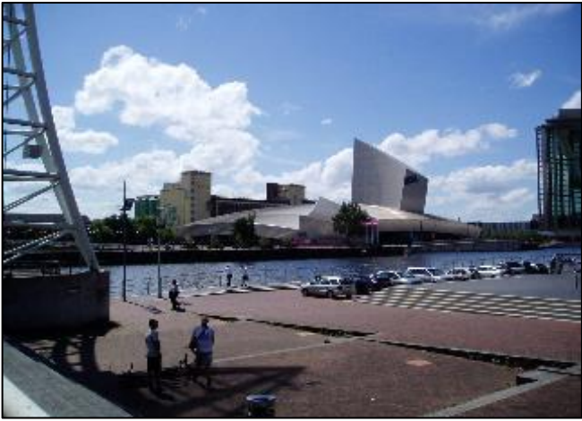
Imperial War Museum

On arriving at the Quays, before going our separate ways, we were able to watch the many free swimmers in the docks, a Saturday morning activity there. None were tempted to join them.