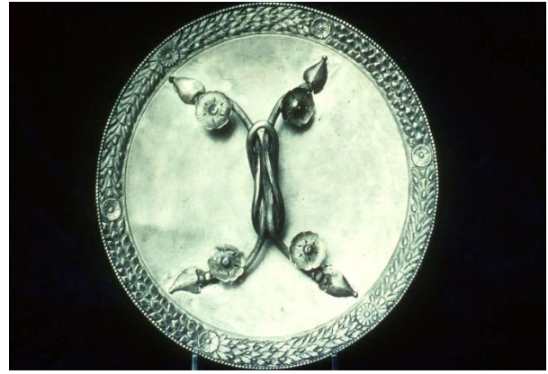
Silver mirror from Wroxeter

Wroxeter was the centre of a network of roads linking a range of smaller Shropshire sites both military and civilian in nature. There were forts including ones at Rhyn Park near Oswestry and at Walltown just outside Cleobury Mortimer. Another at Brompton (near Welshpool) has been excavated recently and several others near Church Stretton and at Westbury are