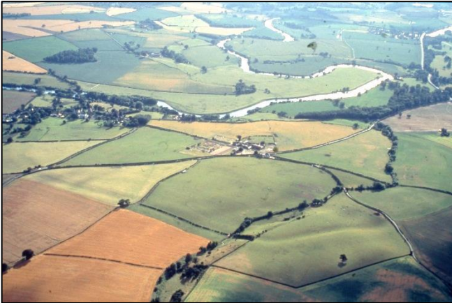
Aerial view of Wroxeter