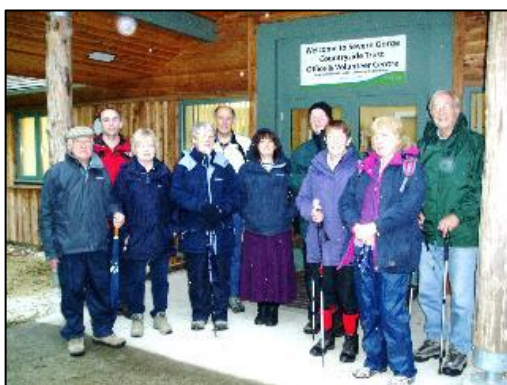
Members outside the SGCT Centre ready for the summer walk