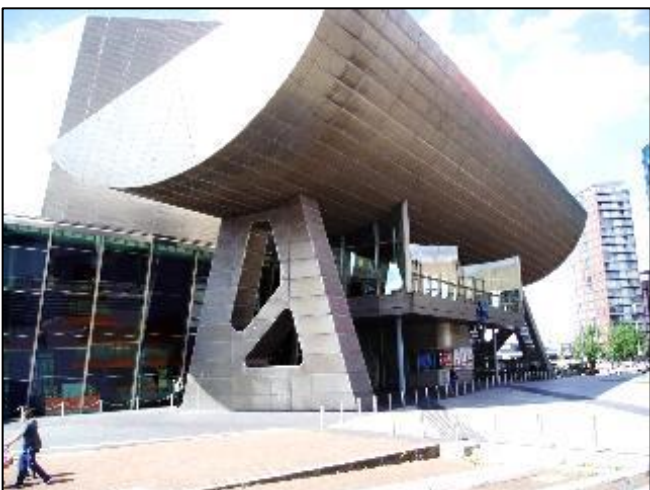
Lowry Art Centre at Salford Quays

Some even ventured into the Lowry Outlet Centre.