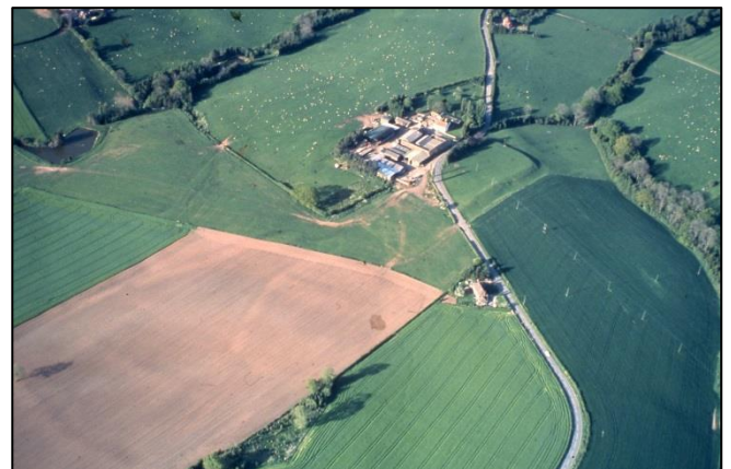
Walltown Roman fort just outside Cleobury Mortimer

The conventional date for the end of Roman rule in Britain is AD 410.