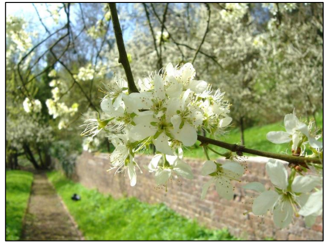
Damson blossom in Coalbrookdale Arboretum

The staff are supported by an army of volunteers and local contractors to keep this incredible and ever changing landscape looking amazing and safe to use.