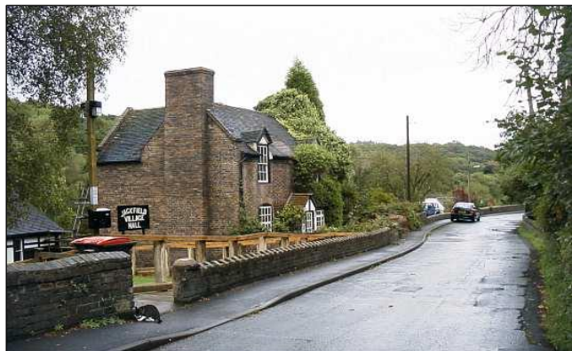
Church Road in Ron's beloved Jackfield

The photographs are a wonderful archive and reminded us how much has changed in fifty years and Ron's commentary was as idiosyncratic and humorous as always.