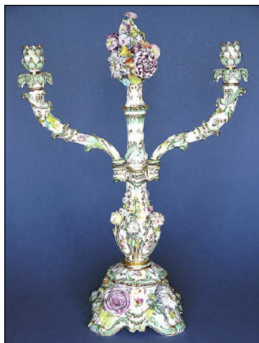
One of the beautiful pieces of Coalbrookdale Ware made between 1820 and 1840

Coalbrookdale Ware, manufactured between the 1820s and 1840s, is renowned for its exotic and ornate forms, fine hand painting and skilful additions such as birds' nests and flowers.