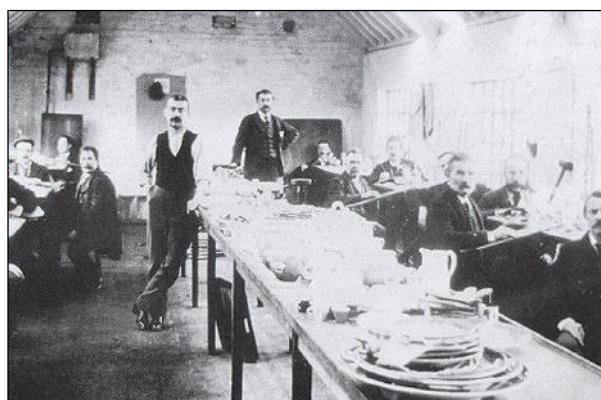
Workers at the Coalport China Works

available for new industries, shops or amenities. This meant that the people preferred to live in neighbouring towns where such facilities did exist.