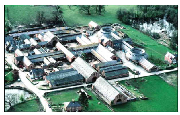
Leighton Model Farm was built in 1848. Unlike Sir Thomas Tancred's design it had a farmhouse and cottages as well as a pool. It also included the latest in Victorian farming technology. Photograph c 1992

alternate wall panels of glass and louvres. It also had a particularly impressive portcullis for its main door. Inside it had a wooden loft some 16 feet high, while a clearly visible 'rat ledge' could be seen on both the inside and the outside of the ground floor. The remains of an old railway system, with an eight foot gauge, can also be seen going through the processing rooms.