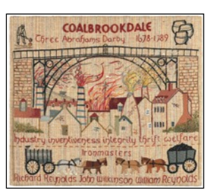
A Quaker Tapestry panel on show at the Coalbrookdale Gallery

An exhibition of colourful panels of embroidery from the Quaker Tapestry Centre in Kendal, Cumbria. The modern bright textile panels give a fascinating insight into key events of the last 350 years from a Quaker perspective. They