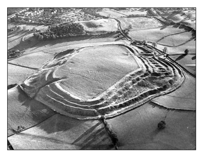
Old Oswestry is now the largest surviving hill fort and is particularly elaborate being unusually sited on a low hill

once the capital of the Cornovii. It is iconic tongue shaped and was possibly built in two stages; Iron Age pottery has been found there. One of the finest, and now the largest surviving one, is Old Oswestry. Unusually this fort sits on a low hill and consequently its defences are particularly elaborate with a series of five ramparts and ditches as well as two entrances which would have been protected by guard towers.