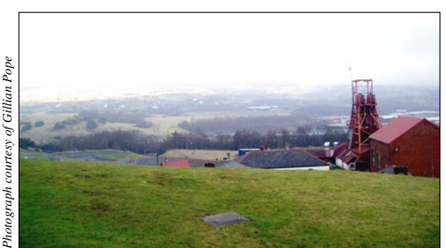
The Big Pit at Blaenavon is now an award winning national museum

blast furnaces and employed about 300 men, and were of crucial importance in the development of the ability to use cheap, low quality, high sulphur iron ores worldwide. The site finally ceased full scale production in 1904.