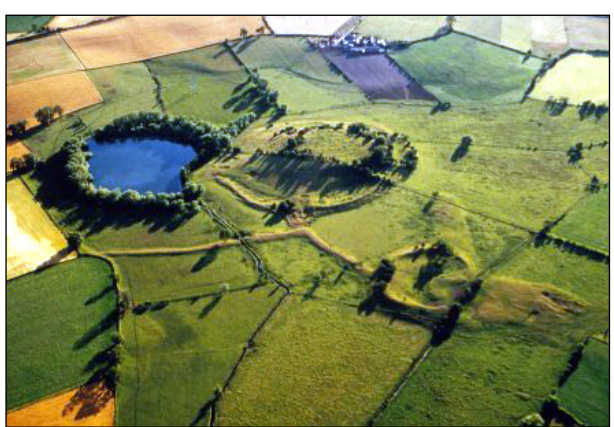
The Berth at Baschurch was built on marshy ground and is linked to firmer ground by a submerged causeway

strangers would not know where to find the track, the inhabitants of the fort would appear to be literally walking on water as they crossed the marsh. In 1906 a bronze cauldron some 12 inches wide was found there in the bed of a stream. The site was excavated in the 1960s and in 2005 spoons made from a copper alloy were found in a nearby field.