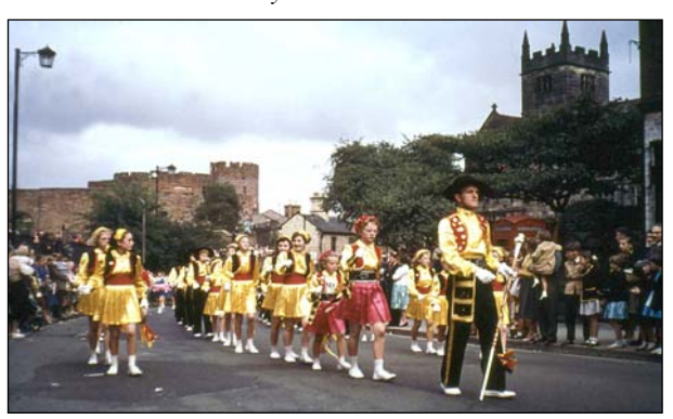
Shrewsbury Carnival about 1966