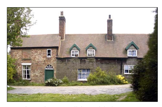
Rudgewood Farm is still there, while the cottages are situatated along the Bridgnorth Road

It is not often that my mother of 82 is stuck for words, but the pictures you sent certainly did it! In fact, she had to sit down! Apparently my mother and her five brothers were brought up in