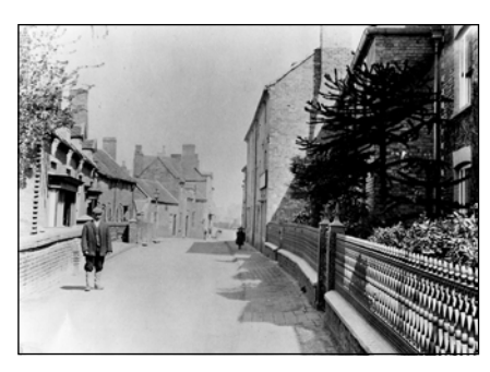
The house in King Street on the left of the picture was once a bakery where the cat used, so it is said, to sleep on the warm loaves in the window

sleep in the window, sunbathing on the warm loaves. Perhaps the local bread buying populace was put off by this unusual addition to the window display, as the shop was closed and demolished in the 1960s or early 70s!