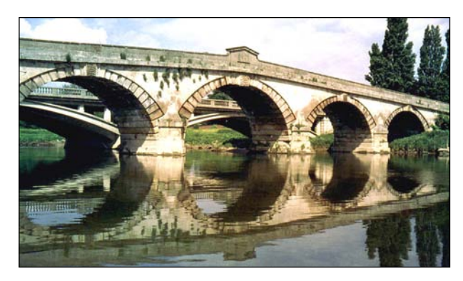
Of the two bridges at Atcham. the near one was built in 1774, the far one in 1929. This now carries the traffic over the river.

Further downstream they came to the bridge at Cressage from where there is a splendid view of the Wrekin. Here a side trip took them to Much Wenlock to the cinema opposite the Guildhall, although today this building houses the museum and tourist office.