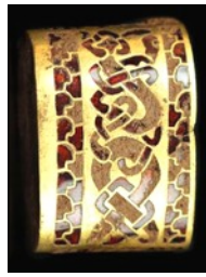
Part of the Staffordshire Hoard, a gold sword hilt fitting with cloisonné garnet inlay

Seen in the main part of the museum, could this have been one of the first fast food outlets in Stoke?