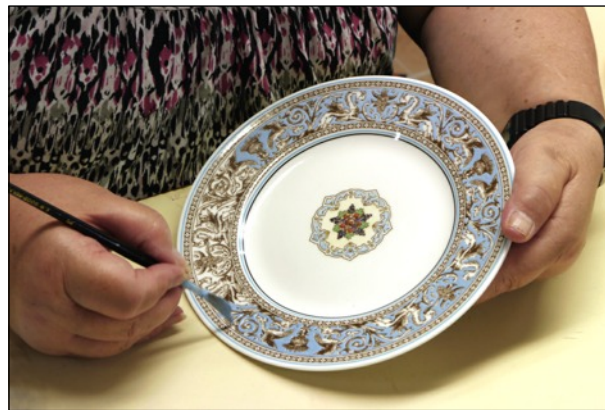
This plate has already had its transfer pattern fired on. Now it is getting its finishing touches of blue enamel before being fired again