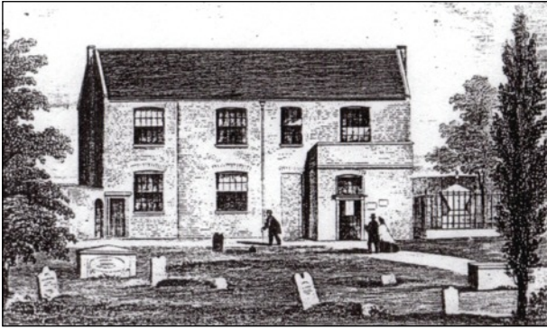
The Birch Meadow Chapel in its early days