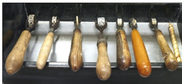
These tools date from the beginning of the Wedgwood manufactory and may well have been used by Josiah himself

and coffee service from him which she subsequently permitted him to call Queen's Ware. His most famous ware, however, was Jasperware which had a cameo design against varying coloured backgrounds. A fascinating and entrepreneurial figure, Josiah might best be described by a quote attributed to himself: "I have for some time past been reviewing my experiments and find such Roots such Seeds as would open and branch wonderfully if I could nail myself down to the cultivation of them for a year or two."