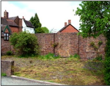
The original front wall of the old Birch Meadow Chapel manse can still be seen from Birchmeadow Road