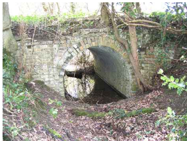
Limestone Tramway bridge at side of track leading to Benthall Edge

The major extractive industry was that of limestone quarrying. This was for use in ironmaking as well as being burnt for use in agriculture and making mortar. The large scars along Benthall Edge comprise many quarries where the exposed limestone was quarried. The steep dip of the limestone beds meant the quarrying was only commercially viable along this narrow strip. The main phase of working was in the 18 th and early 19 th centuries but no written details remain from this time. Two later concerns which mainly burnt lime are